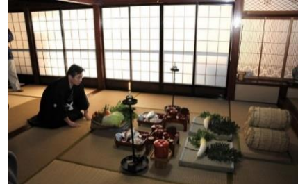
Agricultural ritual “Aenokoto”