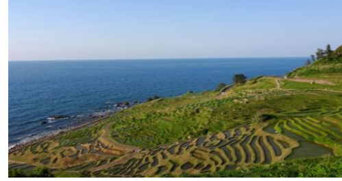
Rice terraces “Shiroyone Senmaida”