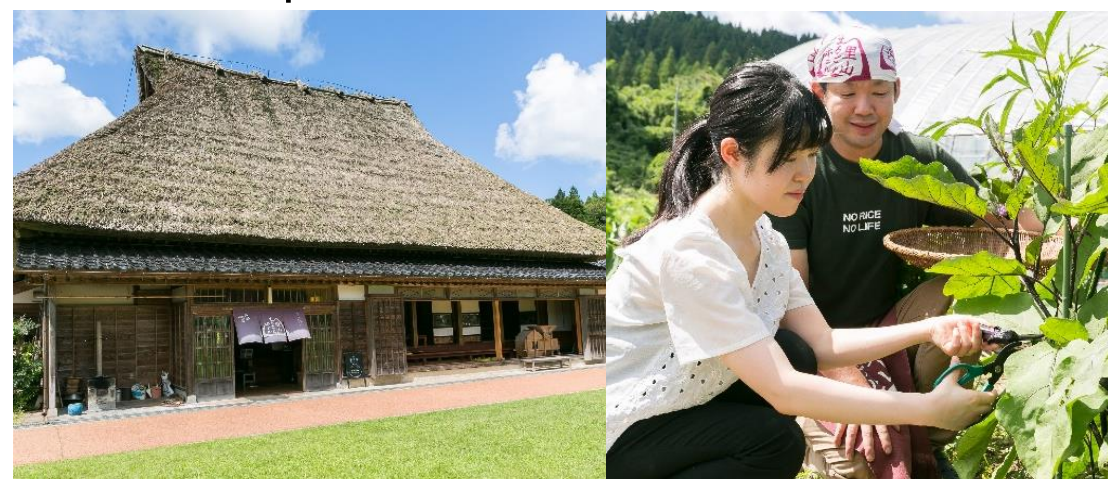
Farmer's Guest house “Satoyama-Marugoto-Hotel”

Stay at a farmer's inn and enjoy local cuisine, farming experience, beautiful scenery, and other aspects of farm life.