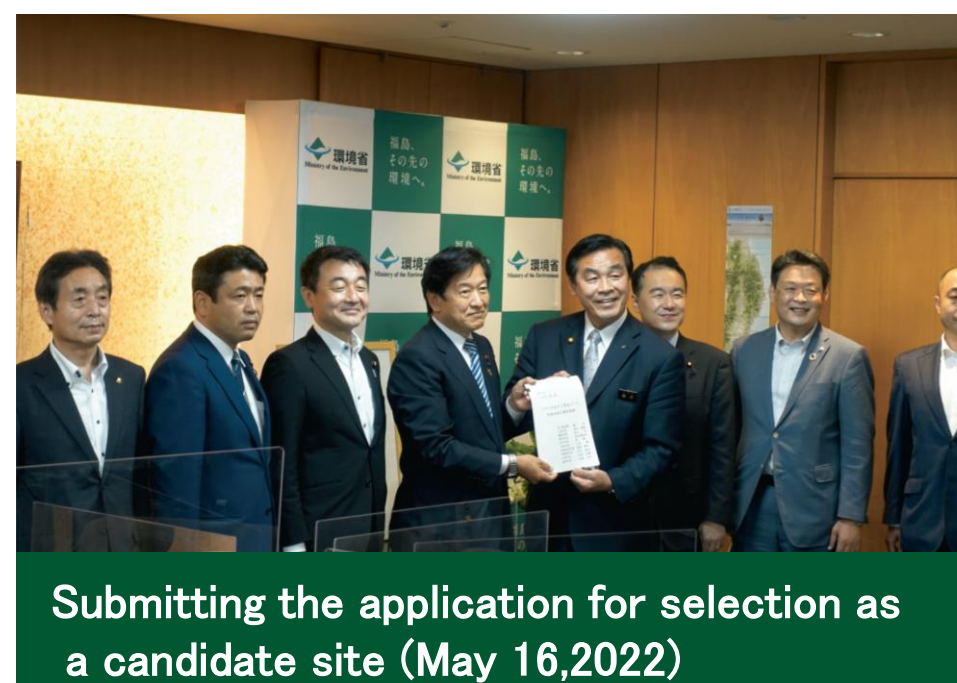
Submitting the application for selection as a candidate site (May 16, 2022)