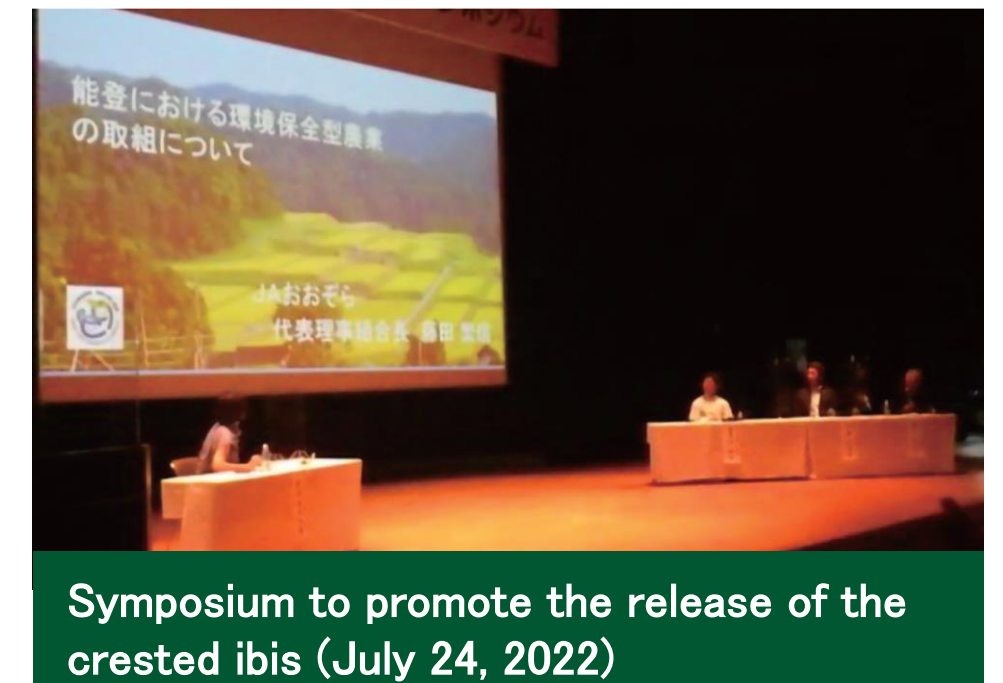
Symposium to promote the release of the crested ibis (July 24, 2022)

Ishikawa Prefecture has been engaged in various initiatives including dispersal breeding and promotion of awareness of the crested ibis through public display, as its last confirmed habitat on the mainland. In August 2022, the Noto region was selected as a candidate site for the release of the crested ibis by the Government. An environment in which the crested ibis can live is a sign of rich biodiversity and is considered to deepen the value of the “Noto’s Satoyama and Satoumi”. For this reason, we have started to improve the environment, including rice paddies as feeding grounds and forests as nesting sites for the crested ibis, in cooperation with relevant municipals and organisations. We will work to realize the dream of the crested ibis soaring through the skies of Noto and Ishikawa.