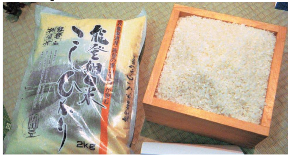
“Noto-Tanada-Mai” Rice grown in rice terraces with 50% less pesticides & chemical fertilizers can be sold at 30% higher prices

Increase farmers' profitability, Encourages farmers to keep farming, Enables farmers to pass on field to the next generations