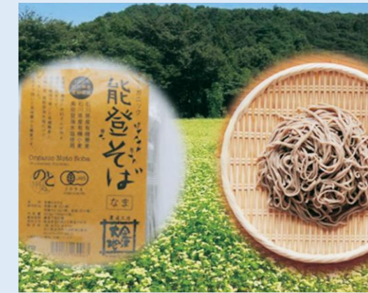
Organic farming using abandoned farm lands (Noto buckwheat)

To encourage new business utilizing local resources Total fund amount: $130 million