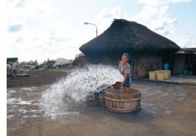
Salt production method “Agehama-style”