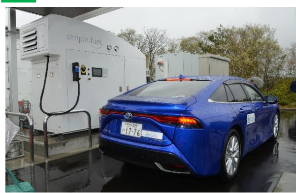
FCV and Hydrogen station

To contribute to carbon neutrality, Hydrogen stations have been opened to enable the transition of tourism transport from PHVs to FCVs (fuel cell vehicles).