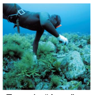
Female “Ama” divers of Wajima