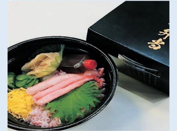
Boxed meals using regional ingredients (“Noto-don” Lunch Box)