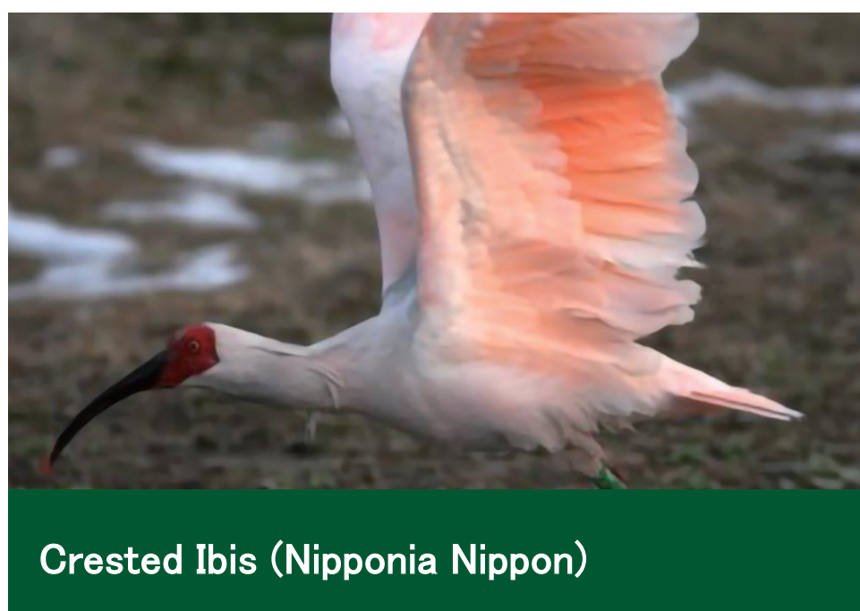
Crested Ibis (Nipponia Nippon)