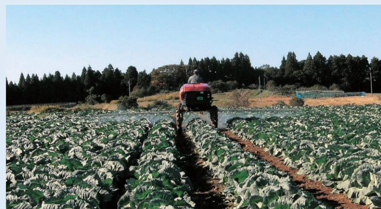
Company from outside the region has started growing cabbages.

To encourage companies from outside the region to start a farming business Total fund amount: $150 million